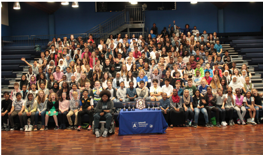
House points competition - overall

The House assembly also applauded the sporting skills of our students and their achievements in numerous borough tournaments throughout the year. Medals and cups were presented including awards for the Sports Day winners.