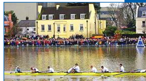
The famous boat race