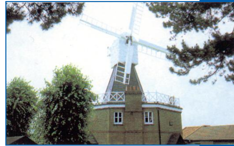
The Windmill on Wimbledon Common

Please note that the entrance to the school and the visitors' car park is on Portinscale Road.